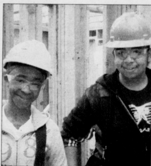
Young people enrolled in Portland YouthBuilders learn skills for vocational careers.

For more information on the work of NAACP branch, visit portlandnaacp.wordpress.com .