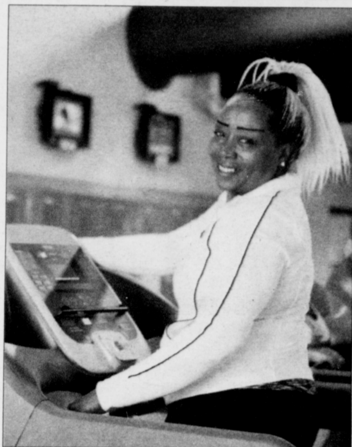
Portland Parks and Recreation is offering incentives to exercise and stay fit.