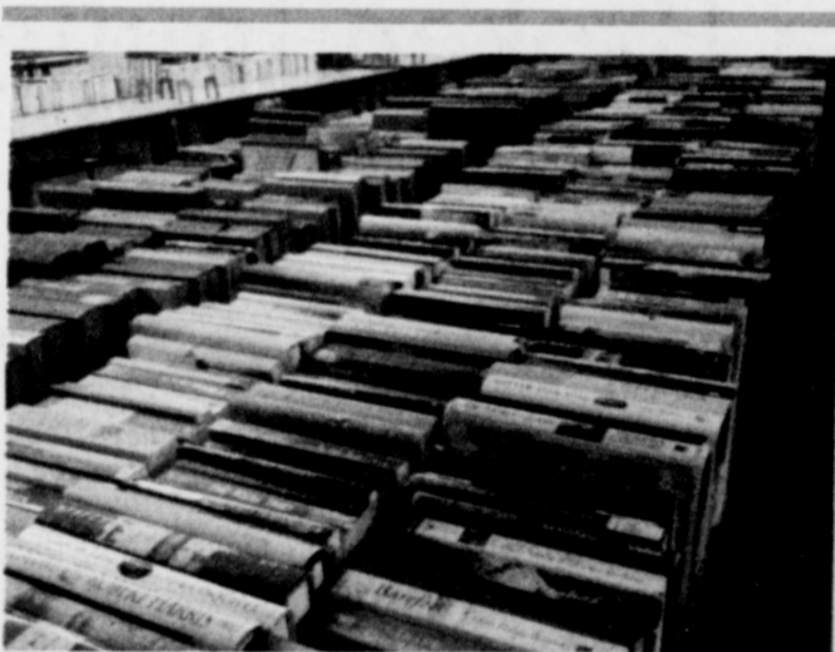
Stacks of books await buyers at the Multnomah County Library's Fall Used Book Sale.

The performance is Wednesday, Oct. 23 at 7:30 p.m. at the Arlene Schnitzer Concert Hall. Tickets are $26-$64 and available at whitebird.org and the Portland 5 box office (formerly Portland Center for the Performing Arts), 1111 S.W. Broadway.