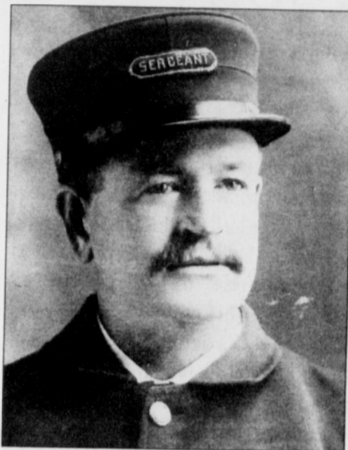
A police sergeant from Portland's early days from the city's police museum.