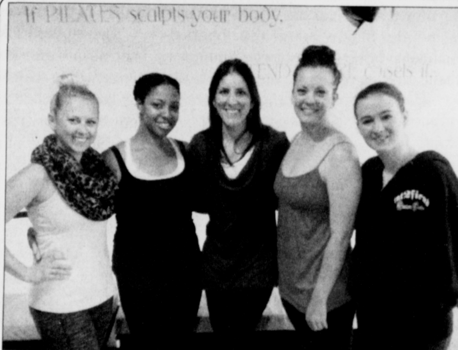
Additional classes currently offered or coming soon are Pilates Mat, Piloxing, and Xtend Barre Stick, all different but equally as effective in sculpting the body. Find us at 3080 SE Division Street, Portland, OR 97202 and visit our website www.xtendbarreportland.com for studio information and class schedules. Meet you at the barre!