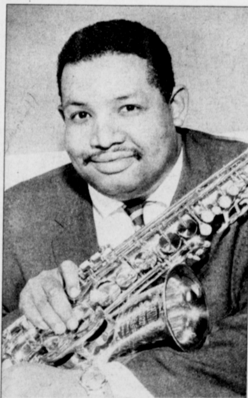
Julian 'Cannonball' Adderley