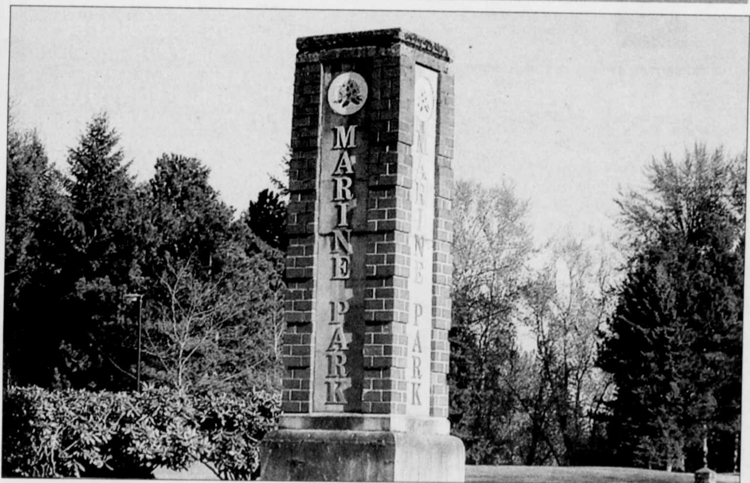
Longtime African American families from Vancouver will gather Saturday for a reunion at Marine Park, upstream from the Interstate Bridge in Vancouver, near the site of a former Kaiser shipyard.