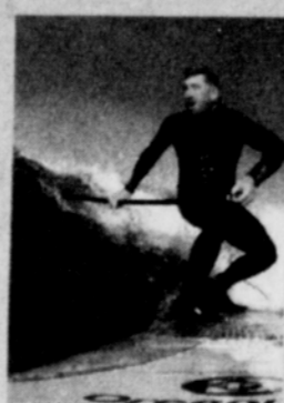
HAVE A GAS!