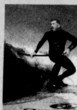
HAVE A GAS!