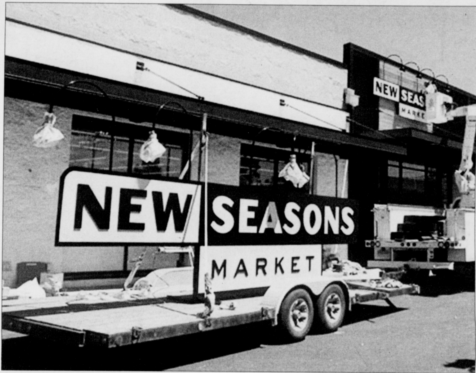
New Seasons Market is celebrating the opening of its new store at 3445 N. Williams Ave.