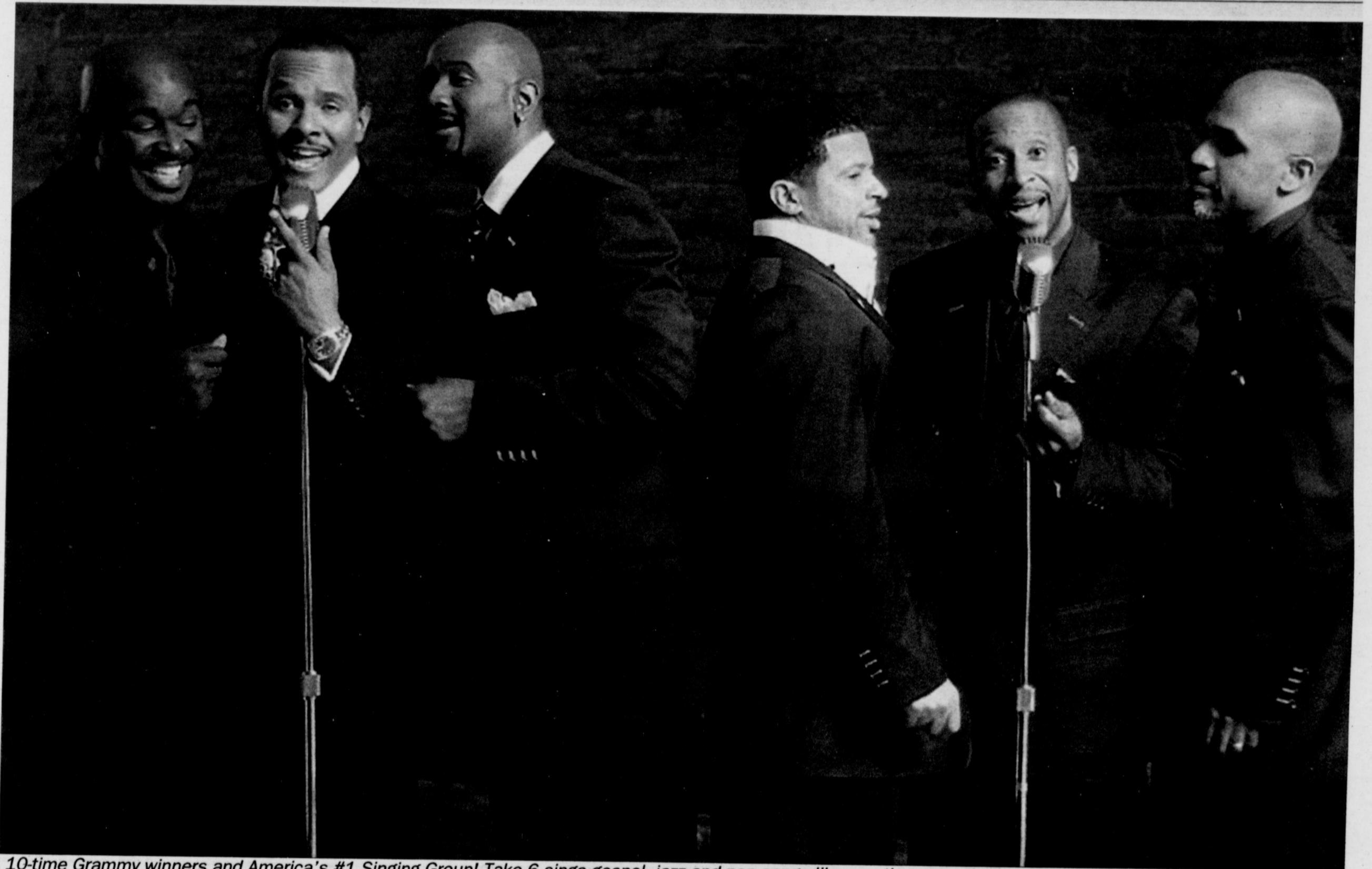
10-time Grammy winners and America's #1 Singing Group! Take 6 sings gospel, jazz and pop songs like no other group in the world.