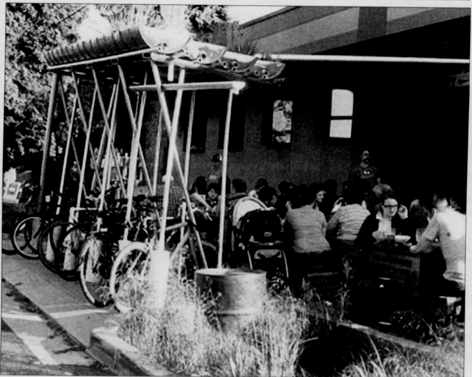
Dekumstruction is a sculptural artwork and stormwater management system integrated with a custom bike rack at the intersection of Northeast Dekum and Durham, adjacent to the Breakside Brewery.