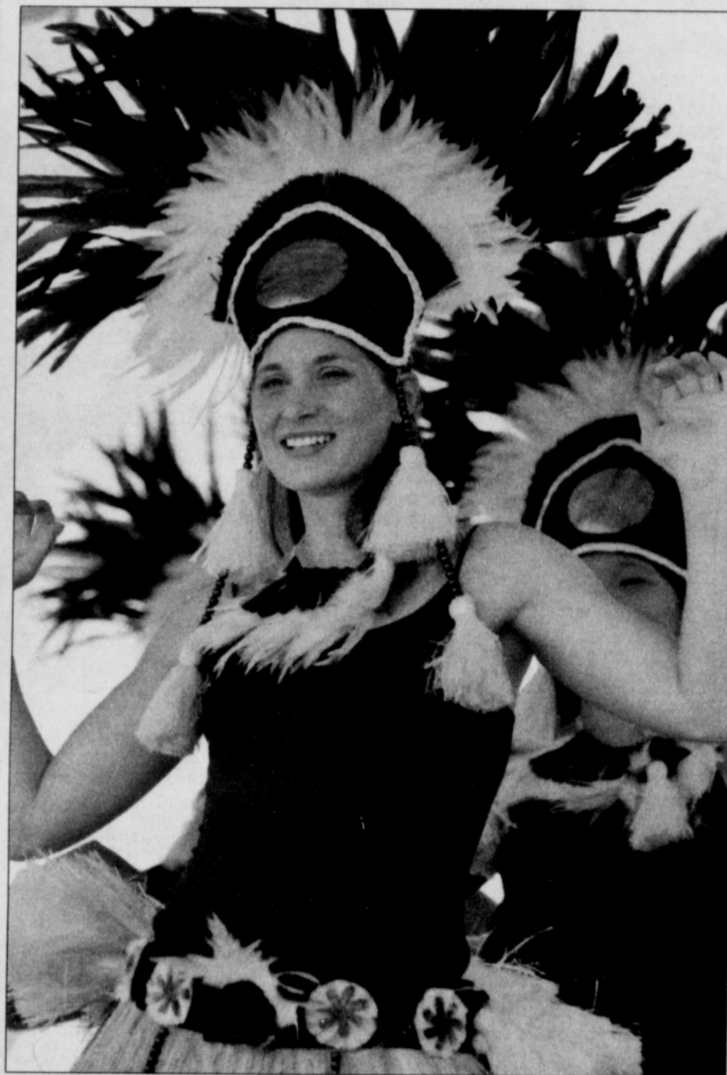
Members of Hula Halau 'Ohana Holo'oko' perform a traditional Polynesian dance during the 2012 Party in the Park at Beaverton's Howard M. Terpenning Recreation Complex at 158th and Walker Road.

LeAnn Rimes has the Oregon Zoo going country. One of the genre's biggest stars, Rimes plays the zoo's summer concert series on Saturday, July 27. Lee Brice, another country star will appear on Thursday, Aug. 8.