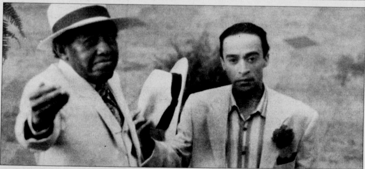
The self-made man of showbiz Juan Orol is featured in a tribute film at the Northwest Film Center.

His quartet also will be performing at the Bijou Café, 132 S.W. Third Ave., on Friday, July 26 from 7 p.m. to 10 p.m.; and finally his septet will be performing at Ivories Jazz Lounge, 1435 N.W. Flanders, on Friday Aug. 2 from 8 p.m. to 11 p.m.