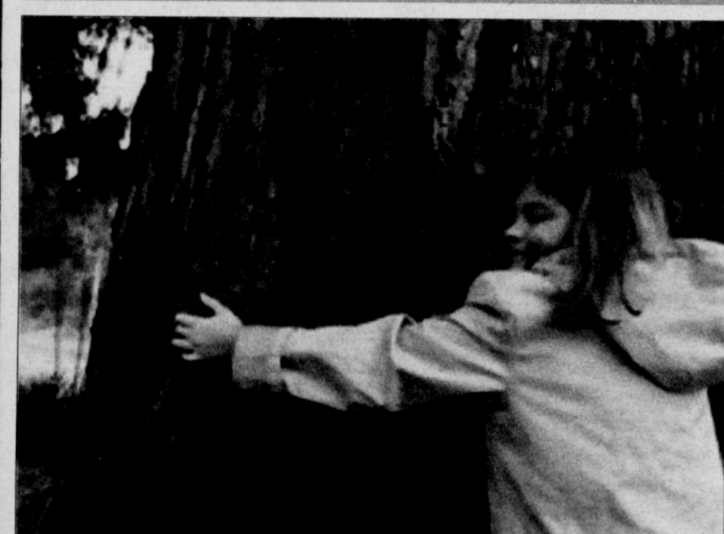
On Saturday, July 20 Portland will try to set a world record for the most tree hugs in one location.