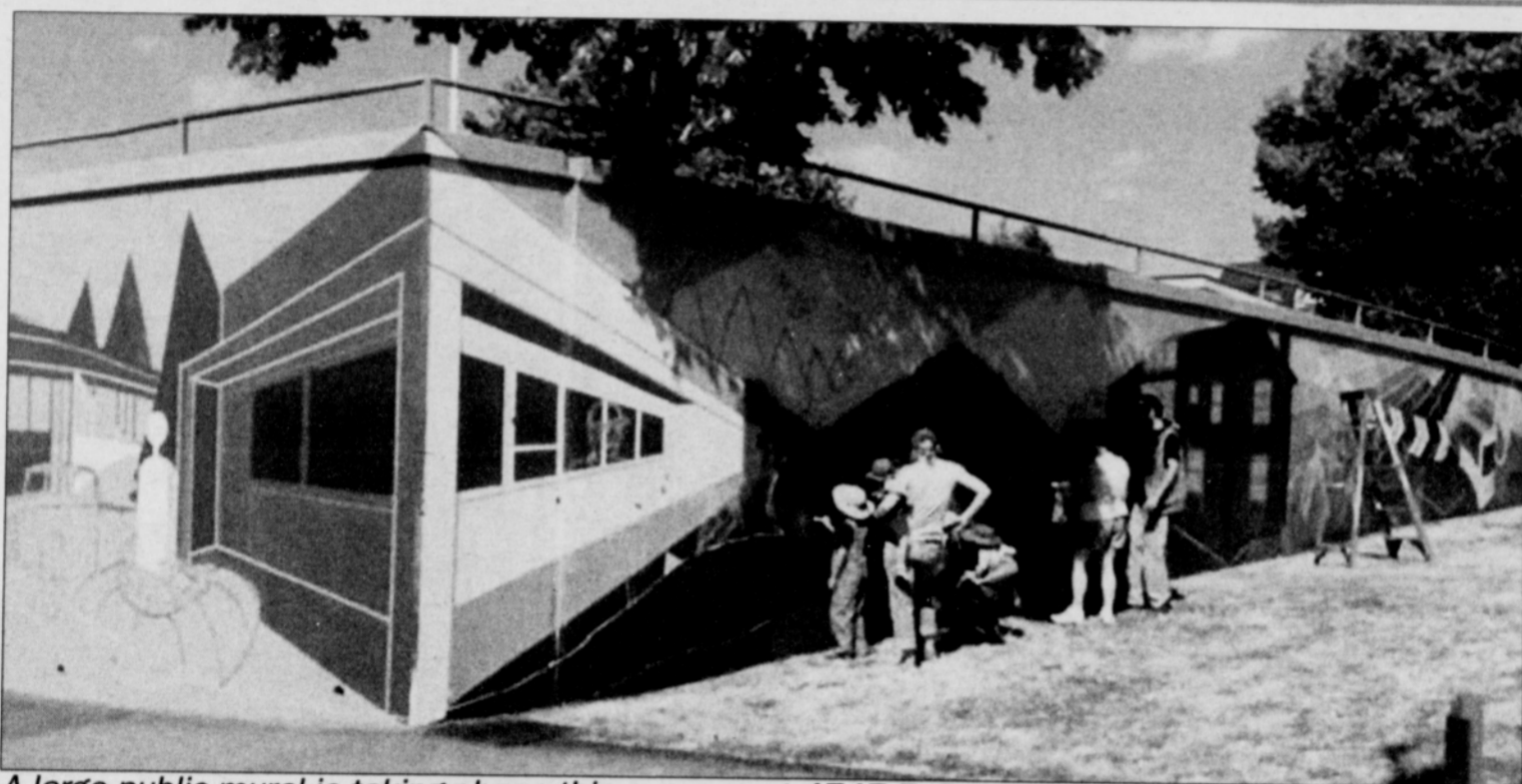
A large public mural is taking shape this summer at 4747 E. Burnside thanks to artists from SpaceCraft: Mission to Arts and the Regional Arts and Culture Council.