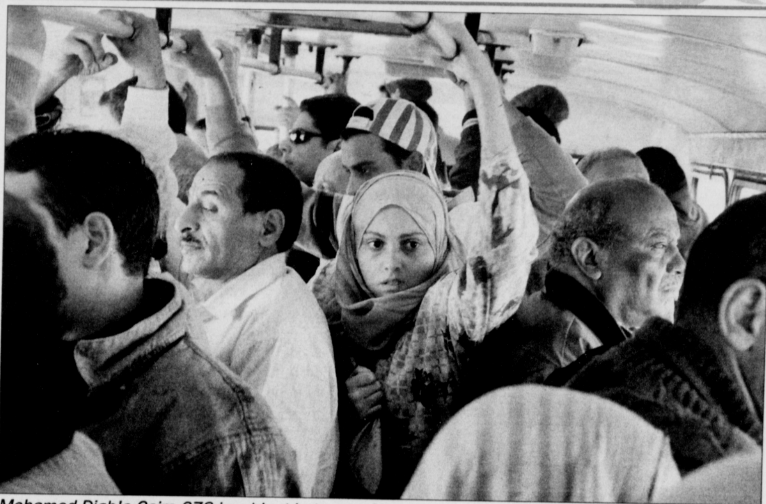
Mohamed Diab's Cairo 678 is a blunt but powerful portrait of women rebelling against Egypt's sexual harassment endemic. The document plays Sunday, July 14 at the Northwest Film Center's Whitsell Auditorium.