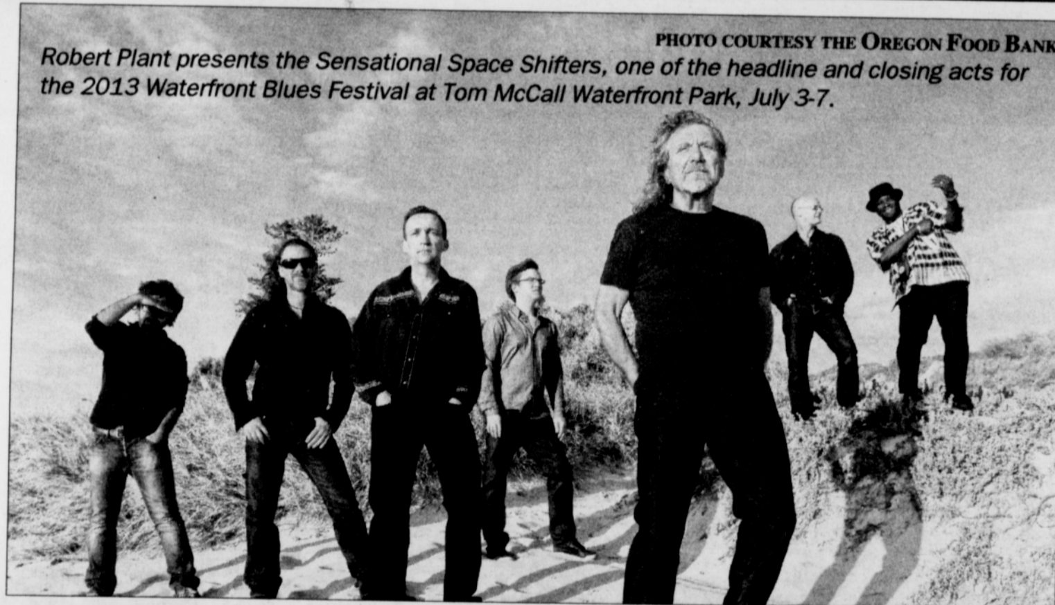
Robert Plant presents the Sensational Space Shifters, one of the headline and closing acts for the 2013 Waterfront Blues Festival at Tom McCall Waterfront Park, July 3-7.

For a complete lineup and more information about tickets, visit waterfrontbluesfest.com .