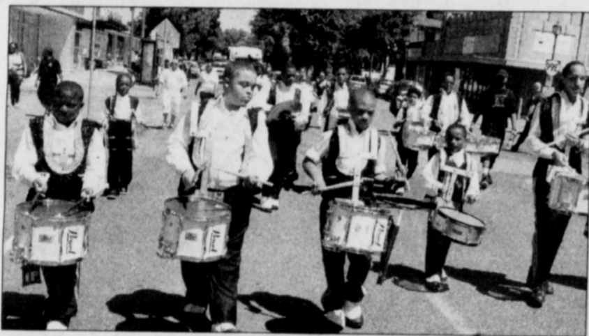
Drumline 2013 Division Champions show off their skills in Saturday's Good in the Hood parade on Northeast Martin Luther King Jr. Blvd.