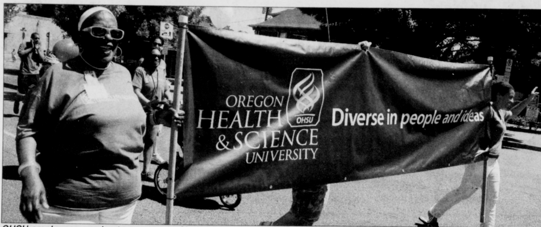
OHSU employees send out a message of being "diverse in people and ideas."