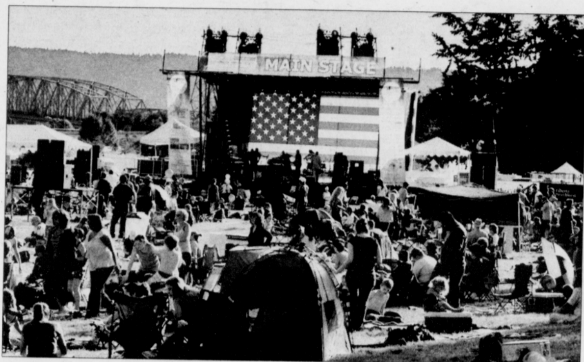
A full day of family fun with live music, games, entertainment and a spectacular fireworks show comes to the Fort Vancouver National Trust for the 50th anniversary of Independence Day at Fort Vancouver on Thursday, July 4.