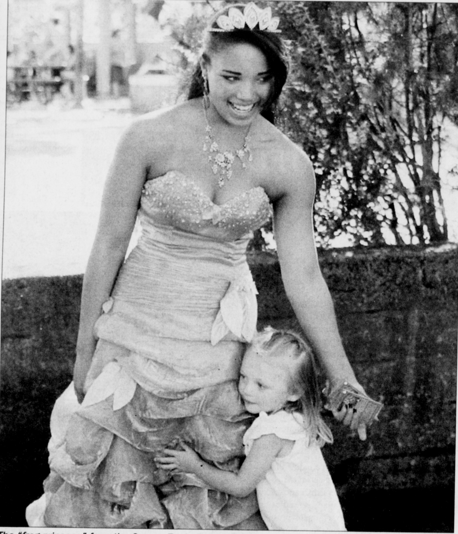
The "frog princess" from the Oregon Zoo's Dragon Theater gets a hug from a young fan during Sunset at the Zoo last summer.