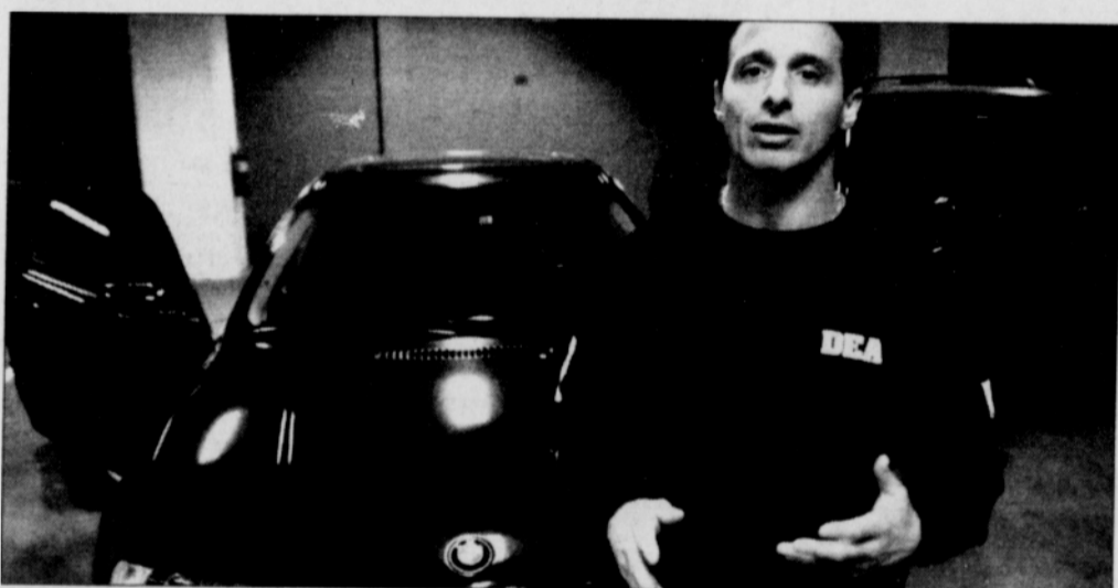
An agent from the federal Drug Enforcement Agency brings some candor to the thought-provoking documentary "How to Make Money Selling Drugs," opening nationally this week with its Portland premier on Friday, June 28 at the Hollywood Theater in northeast Portland.

is comparable to minimum wage earnings, all the way to accomplished drug importers, whose income can be estimated at a minimum of $100 million a year.