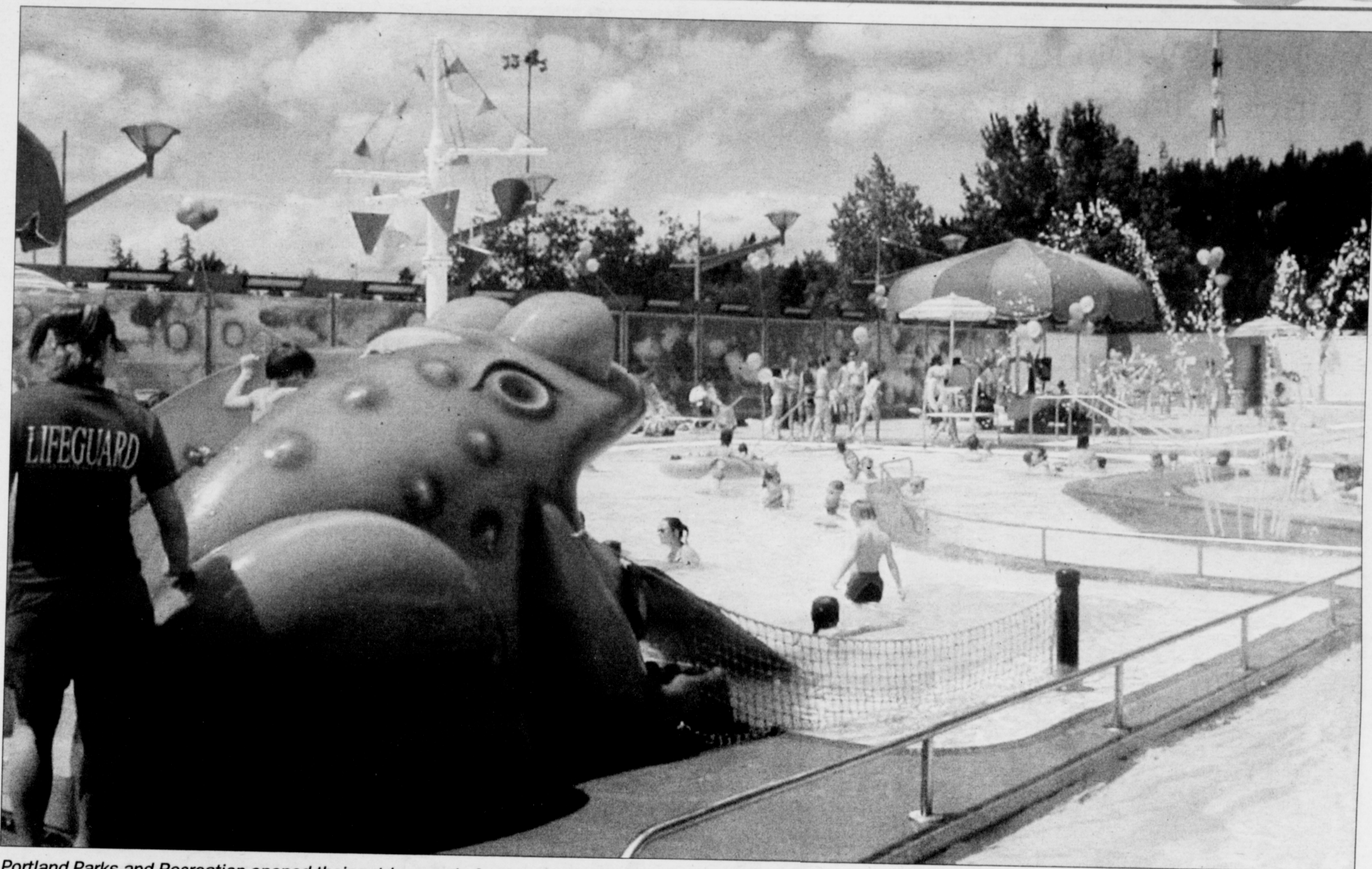
Portland Parks and Recreation opened their outdoor pools for the summer season Tuesday, including Wilson Pool (pictured) in southwest Portland.