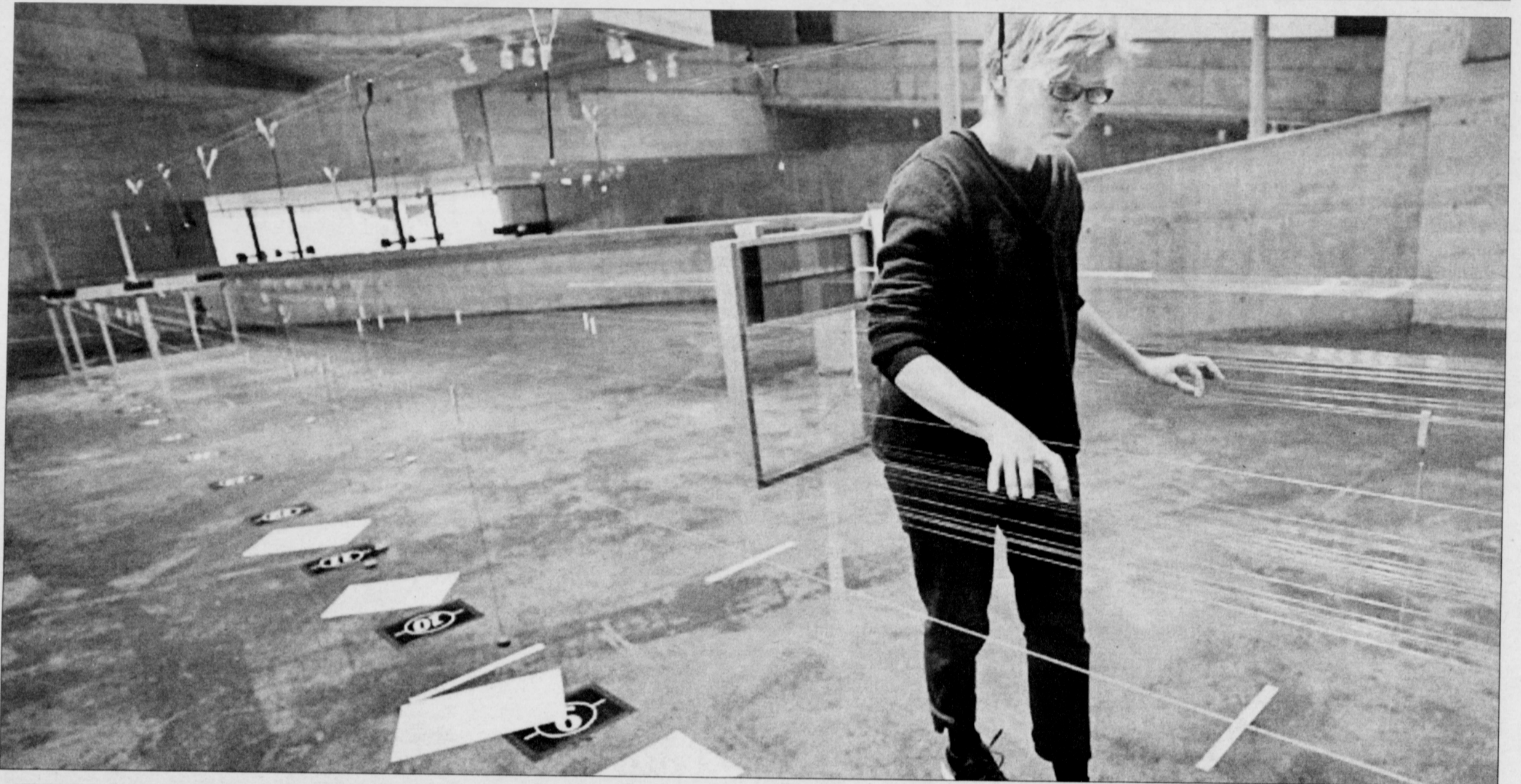
Composer Ellen Fullman performs her room-sized string instrument. The power-amplified piano wire strings are being installed to fit the gallery at Yale Union, 800 S.E. 10th Ave. The public can watch the installation and join Fullman for a June 20 performance.