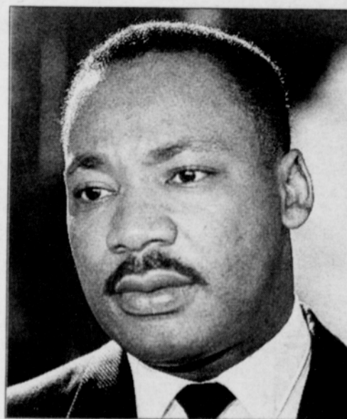
Martin Luther King Jr.

Annual event supports north and northeast Portland