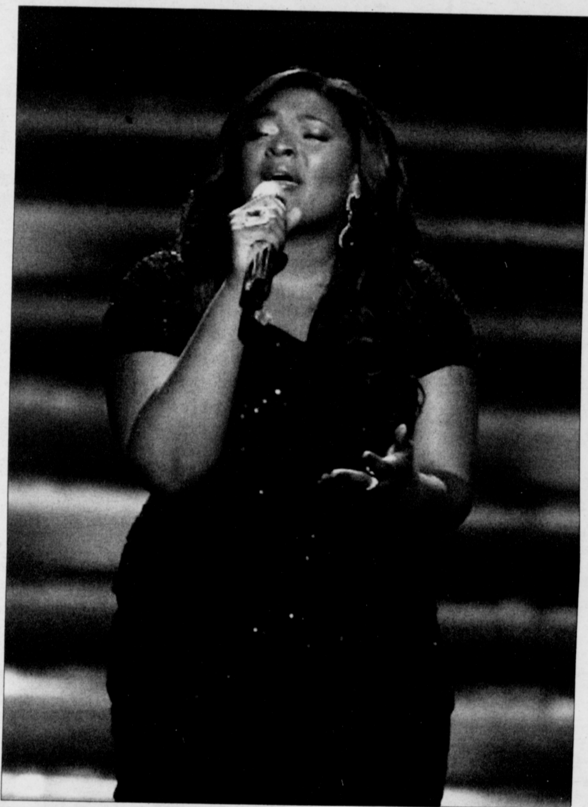
Candice Glover, a 23-year-old R&B singer from South Carolina, performs during the 12th season of American Idol.

The lack of a female champion for the past five years was mocked in a finale bit featuring the female finalists, in cahoots with Sparks, jokingly sabotaging this season's five