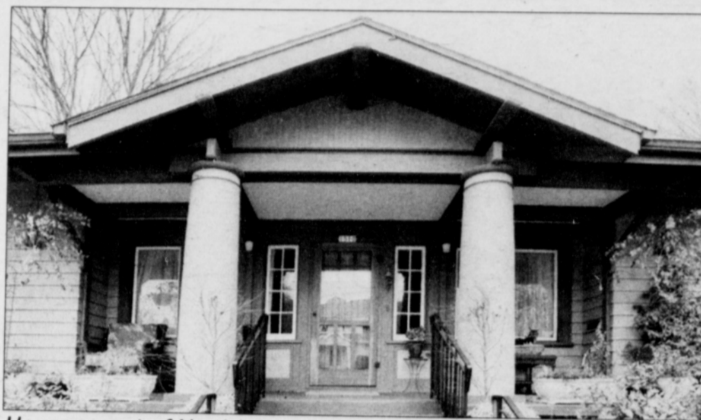
Houses west of Northeast 15th Avenue will be the focus of the Irvington Home Tour, from 11 a.m. to 5 p.m. on Sunday, May 19.