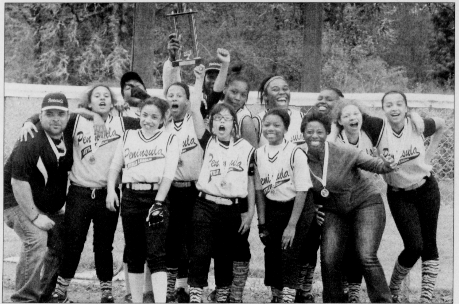
Peninsula Little League all-star girls pose for a photo after their 5-2 championship victory against the Evergreen Fireballs.