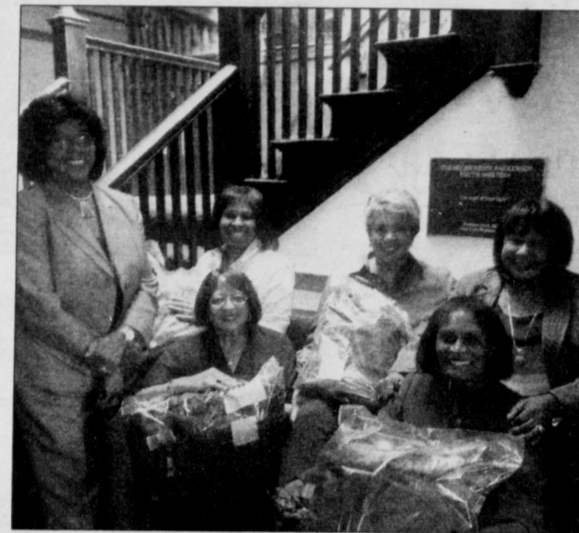
The Portland chapter of The Links donate jeans to homeless youth.