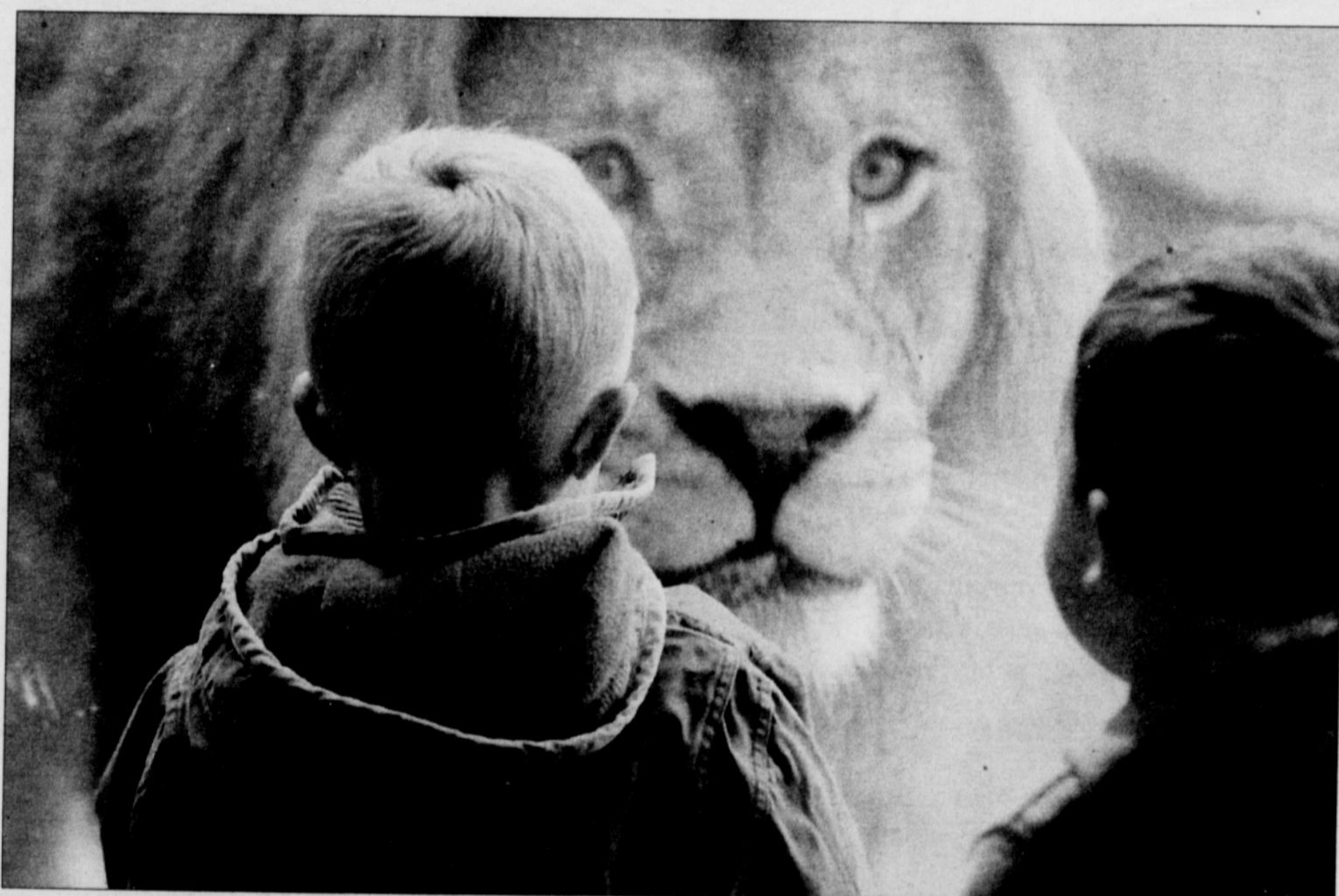
Visitors enjoy a close encounter with Zuwadi the lion at the Oregon Zoo's Predators of the Serengeti exhibit. Kids can learn about wildlife and safety Thursday, May 4 during the zoo's annual Safe Kids Day.