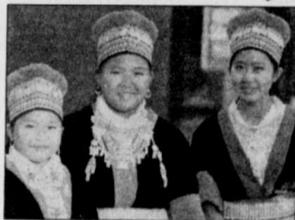
Colored Pencils Art and Culture

Colored Pencils -- Share your culture through song, story and dance at the