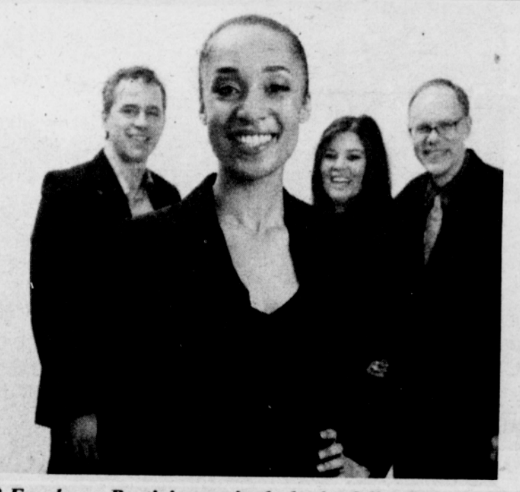
2013 Employer Participants include the following and MORE!