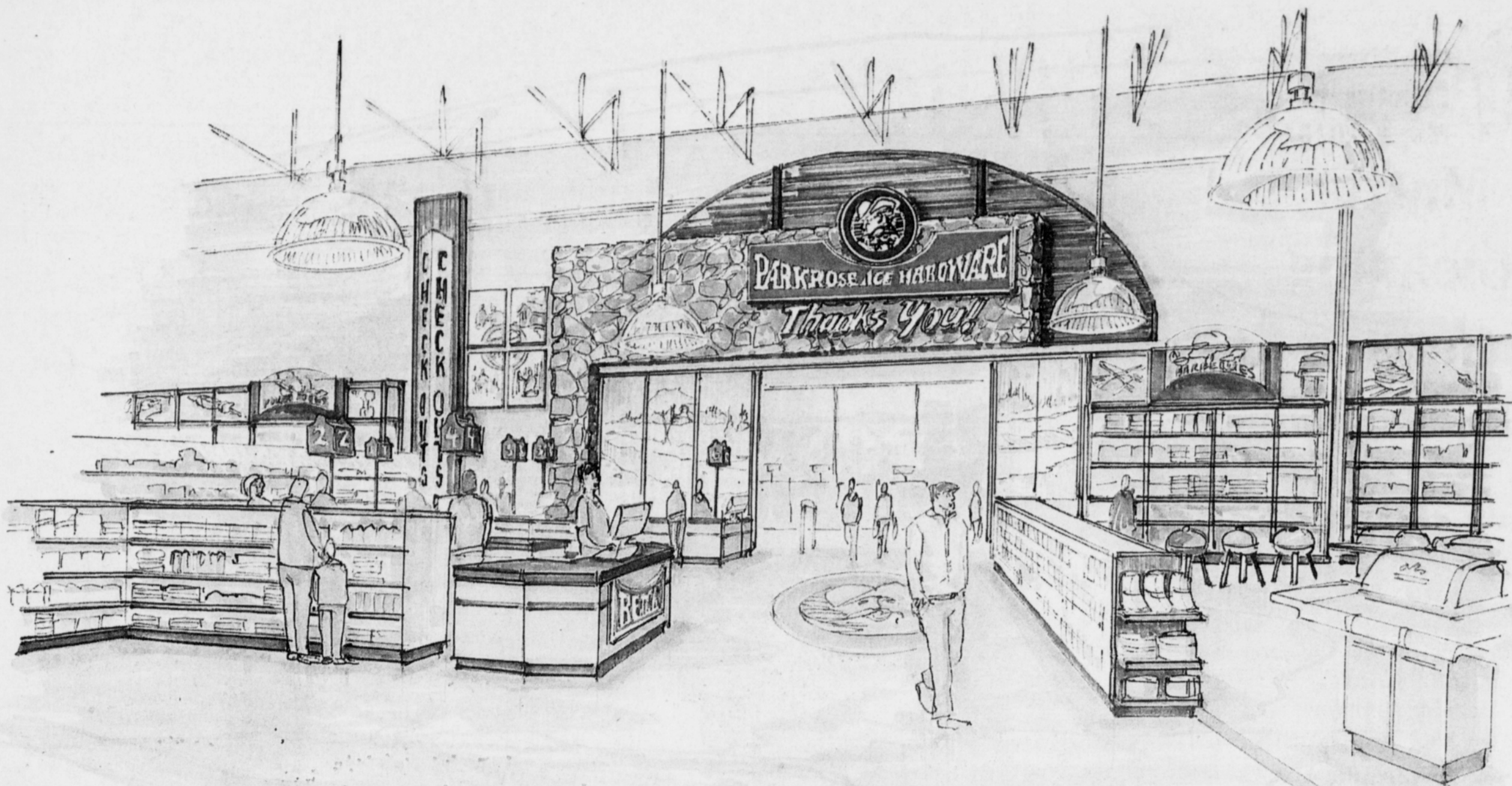
An artist's rendering shows the remodeled family owned and operated Parkrose Ace Hardware store at 10625 N.E. Sandy Blvd. A grand re-opening celebration will take place Friday, Saturday and Sunday, April 12-14