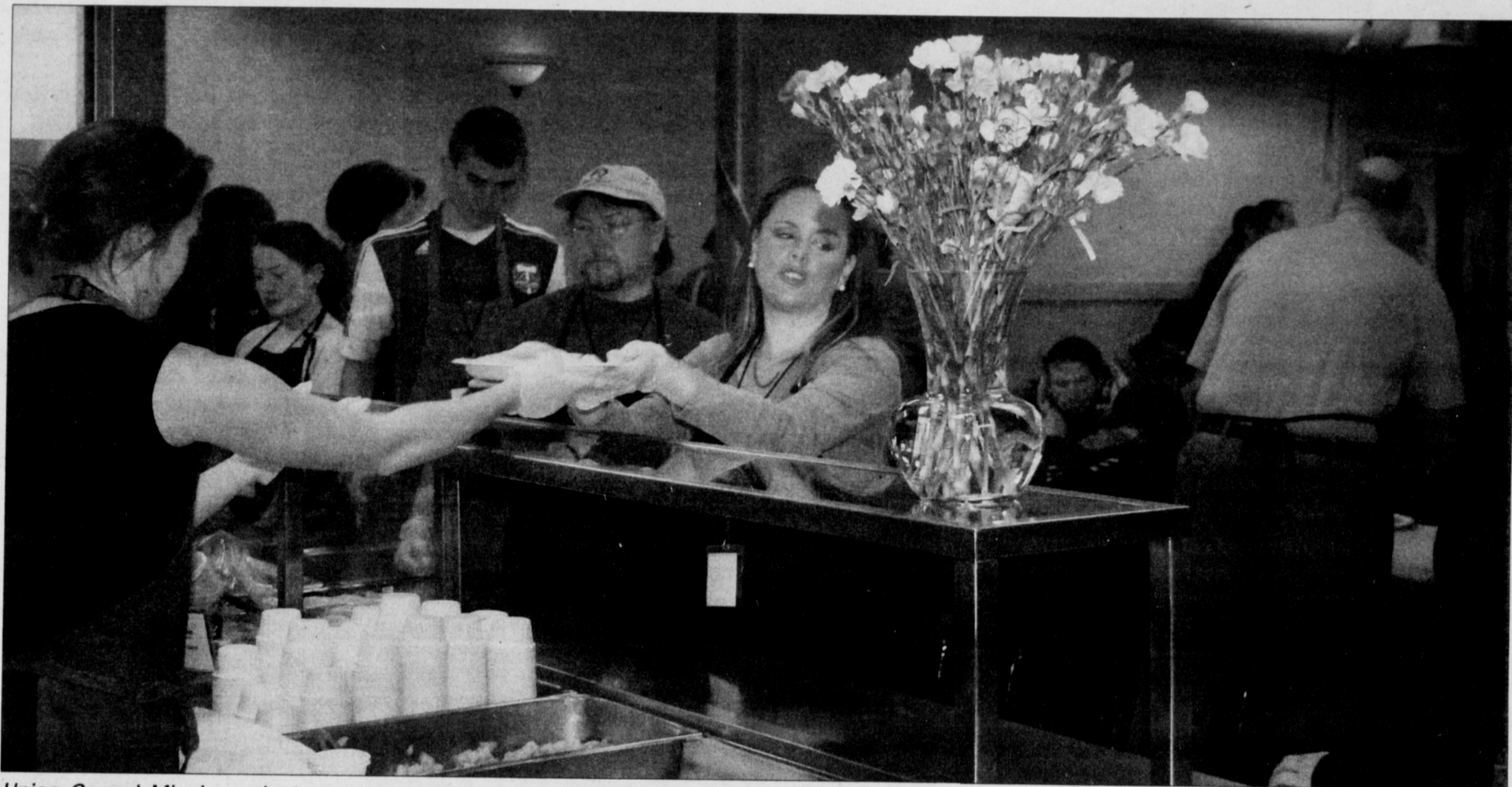
Union Gospel Mission volunteers serve meals at the 2012 Easter Brunch for the homeless.