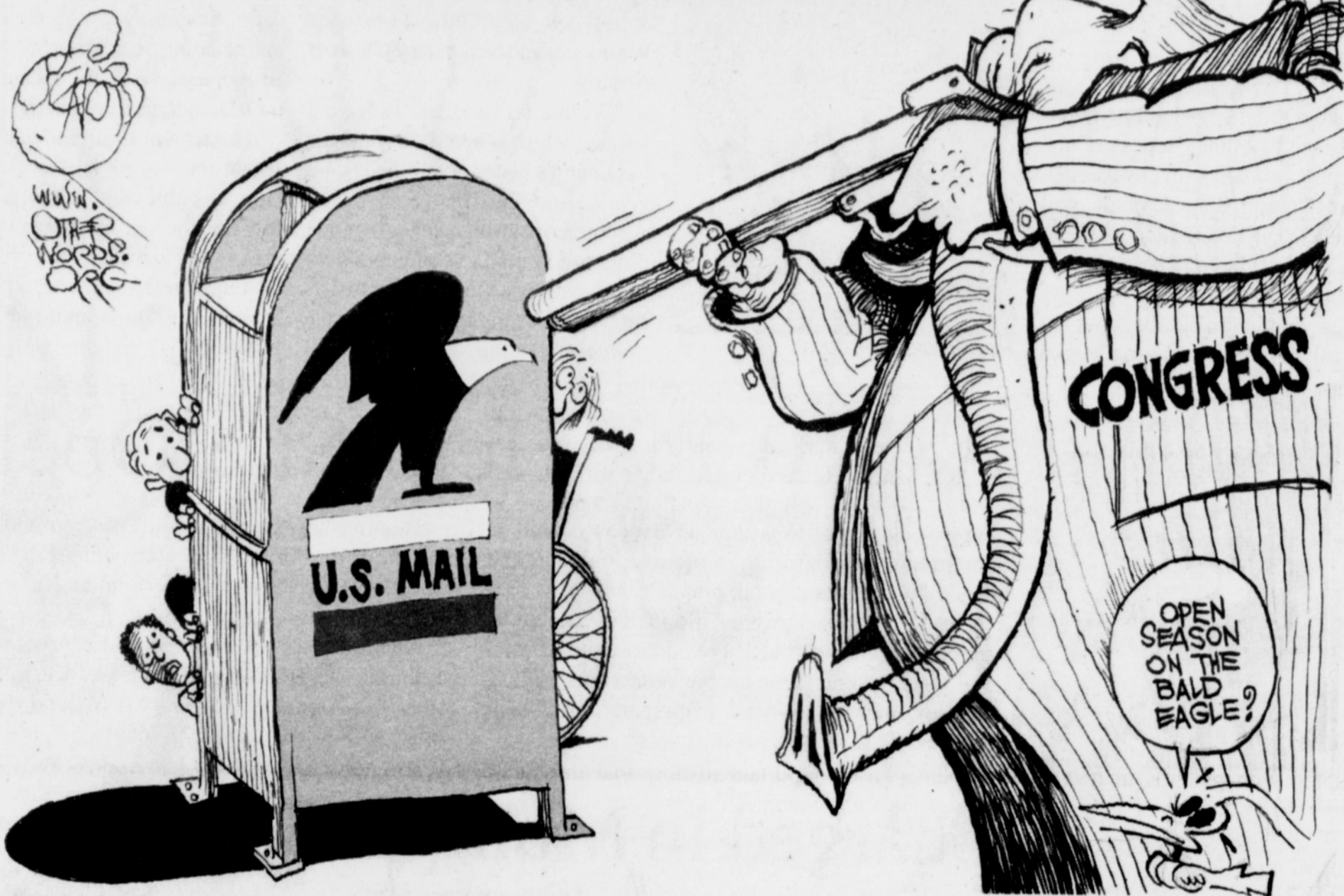
BY KHALIL BENDIB