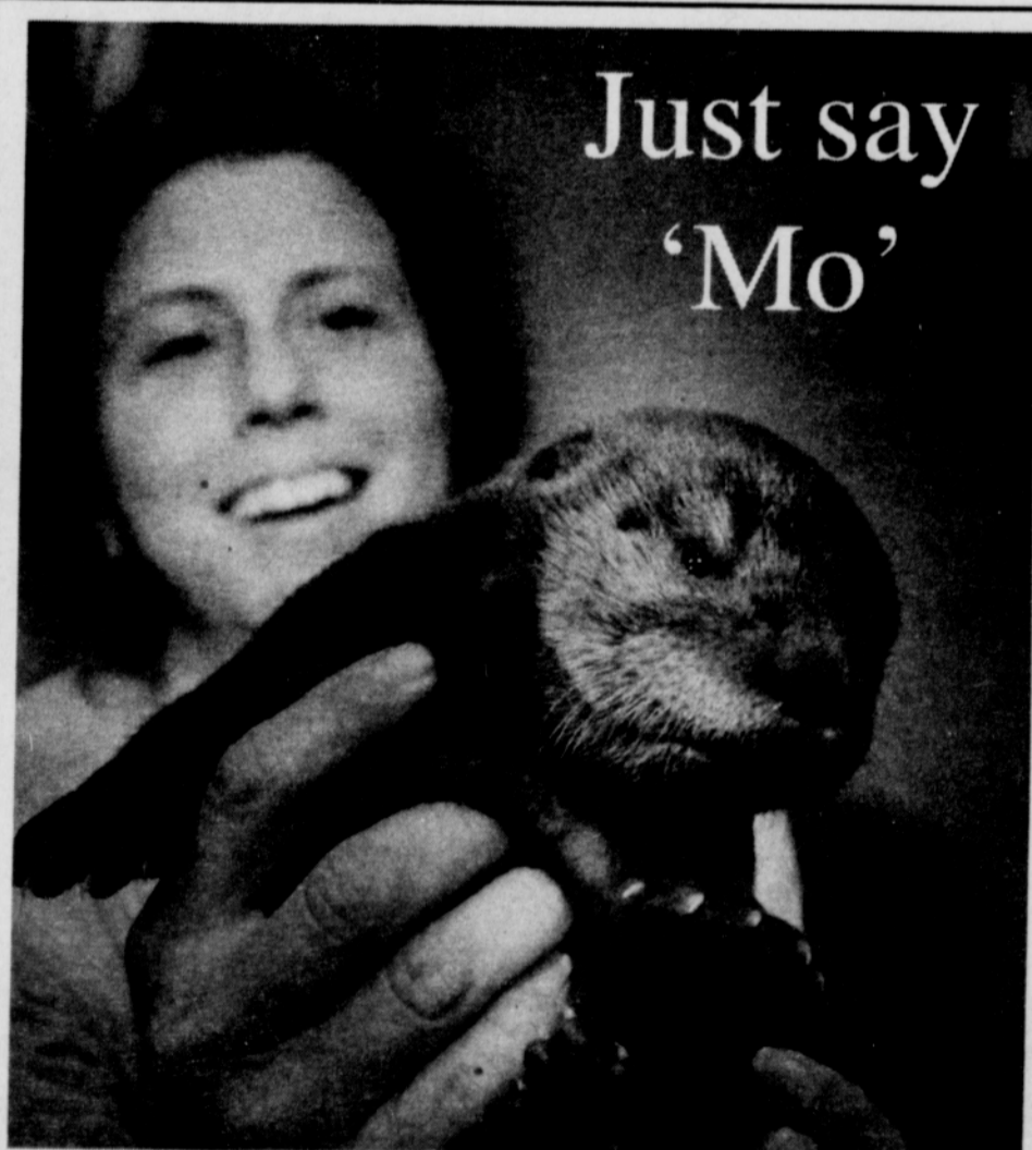
After several weeks of consideration, the Oregon Zoo has settled on a name for its new baby river otter. The pup will be called Molalla, or Mo for short, named after the Oregon river.