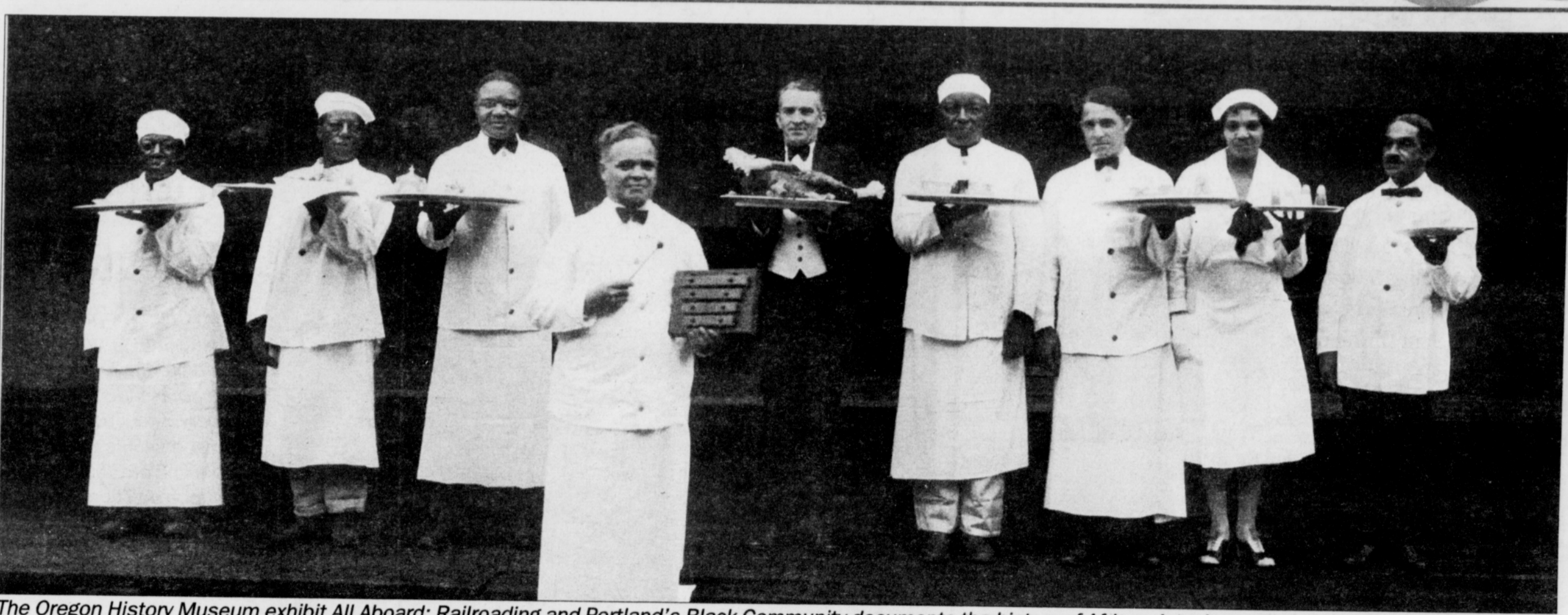
The Oregon History Museum exhibit All Aboard: Railroading and Portland's Black Community documents the history of African American railroaders, porters, and the community that grew up around Portland's Union Station from the late 1800s to the 1940s.