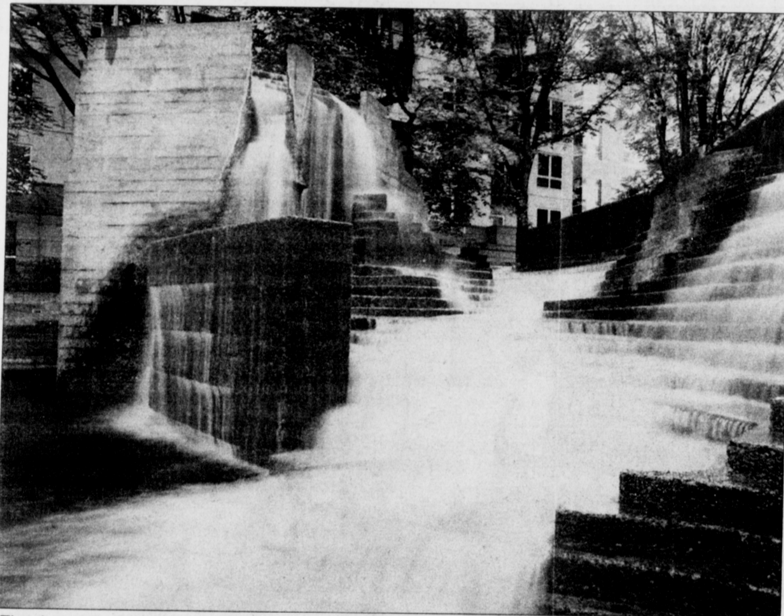
The Lovejoy Fountain plaza in southwest Portland has been listed in the National Register of Historic Places.

Ask about our catering & private parties.