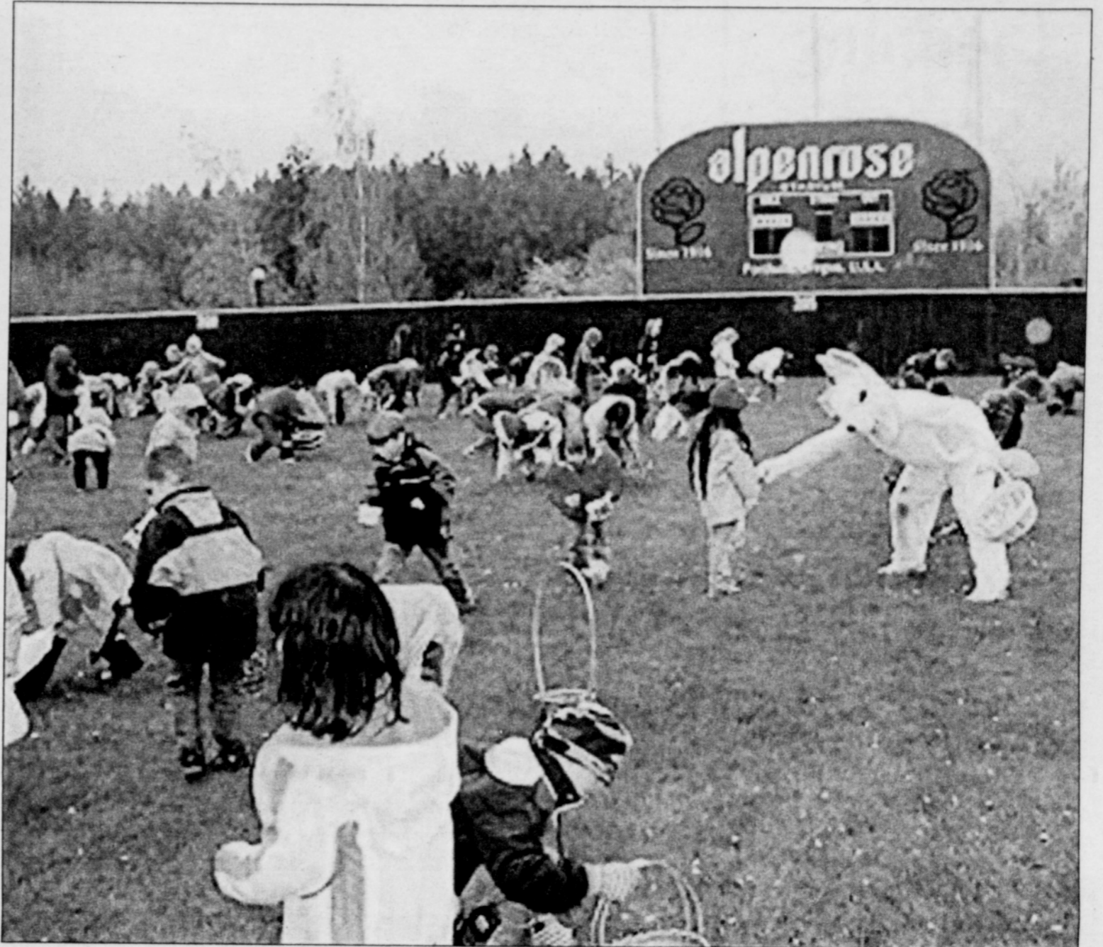
The Alpenrose Dairy Easter Egg Hunt returns on March 30, the Saturday before Easter.