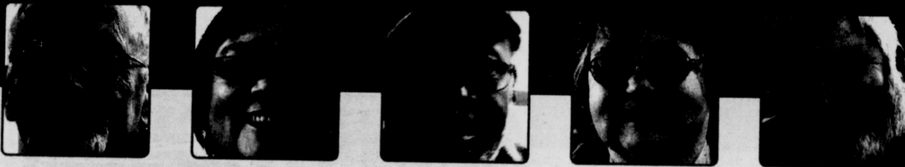
Transit worker retirees: good neighbors active in our community

TriMet management's recent threat to cut our passengers' service is unacceptable. We plan to do our part and negotiate a labor contract that is good for both our community and our families. But, our willingness to sacrifice will be for nothing unless someone starts to control management's spending.