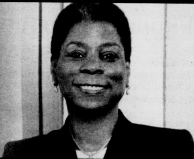
Ursula M. Burns

Company: Xerox Corporation Position: Chairman and CEO