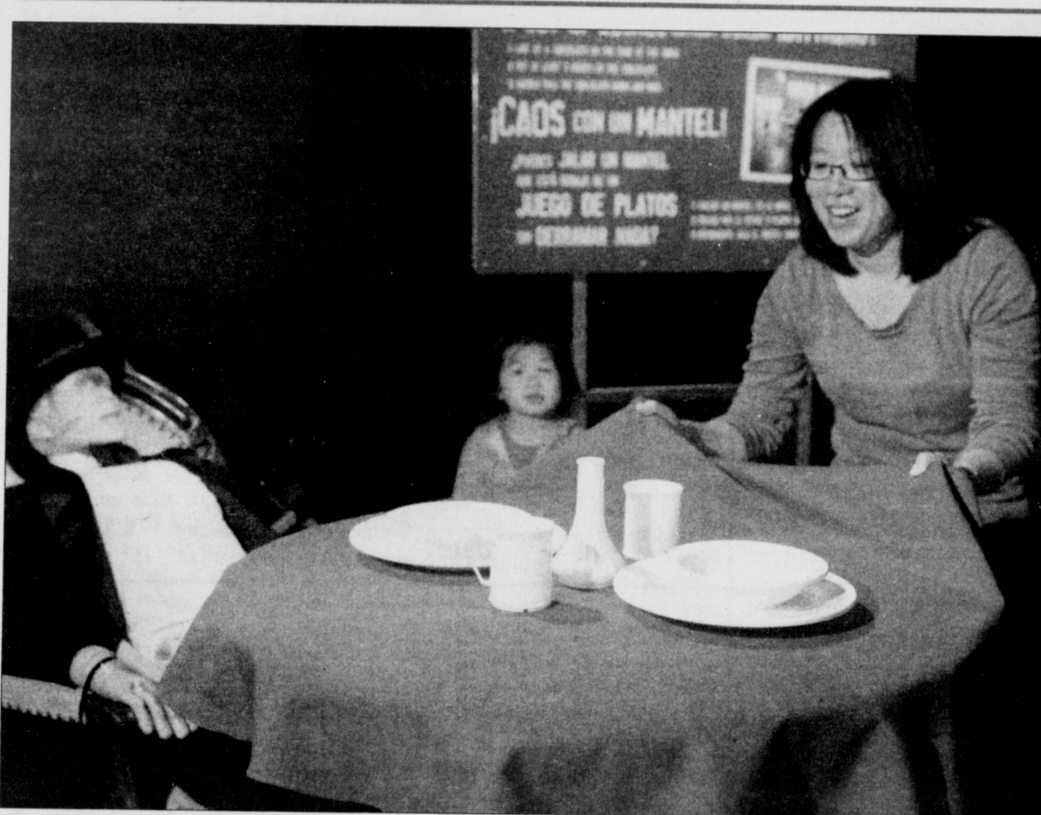
The Mythbusters exhibit at OMSI allows visitors to dive into the scientific method to explore myths associated with human reaction time and momentum.