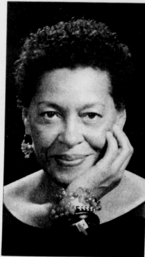
Carrie Mae Weems

The exhibit features some of her most groundbreaking work, including Ain't Jokin' , From Here I Saw