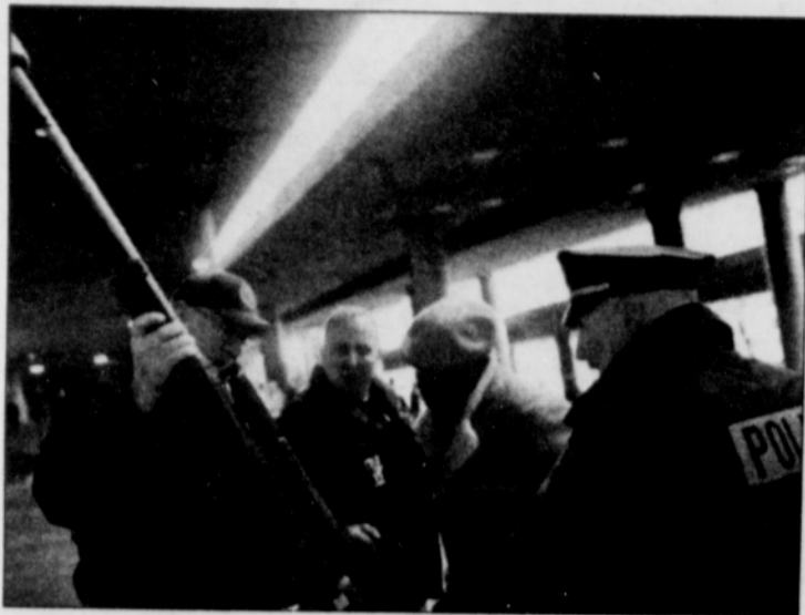
← An inert surface to air missile launcher is brought to a gun buy back program ...more run by Seattle Police.