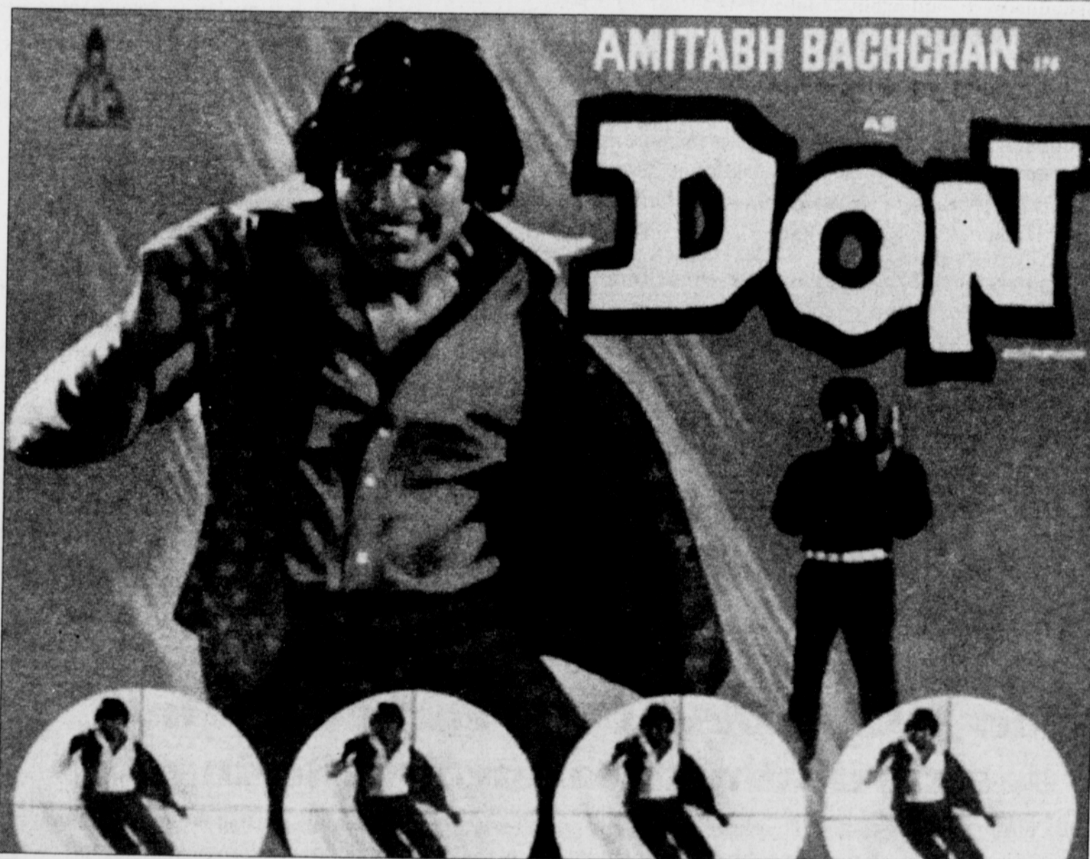
The 1978 cult classic 'Don,' one of India's biggest box office hits, will be previewed Thursday Jan. 31 as part of a celebration of Bollywood.