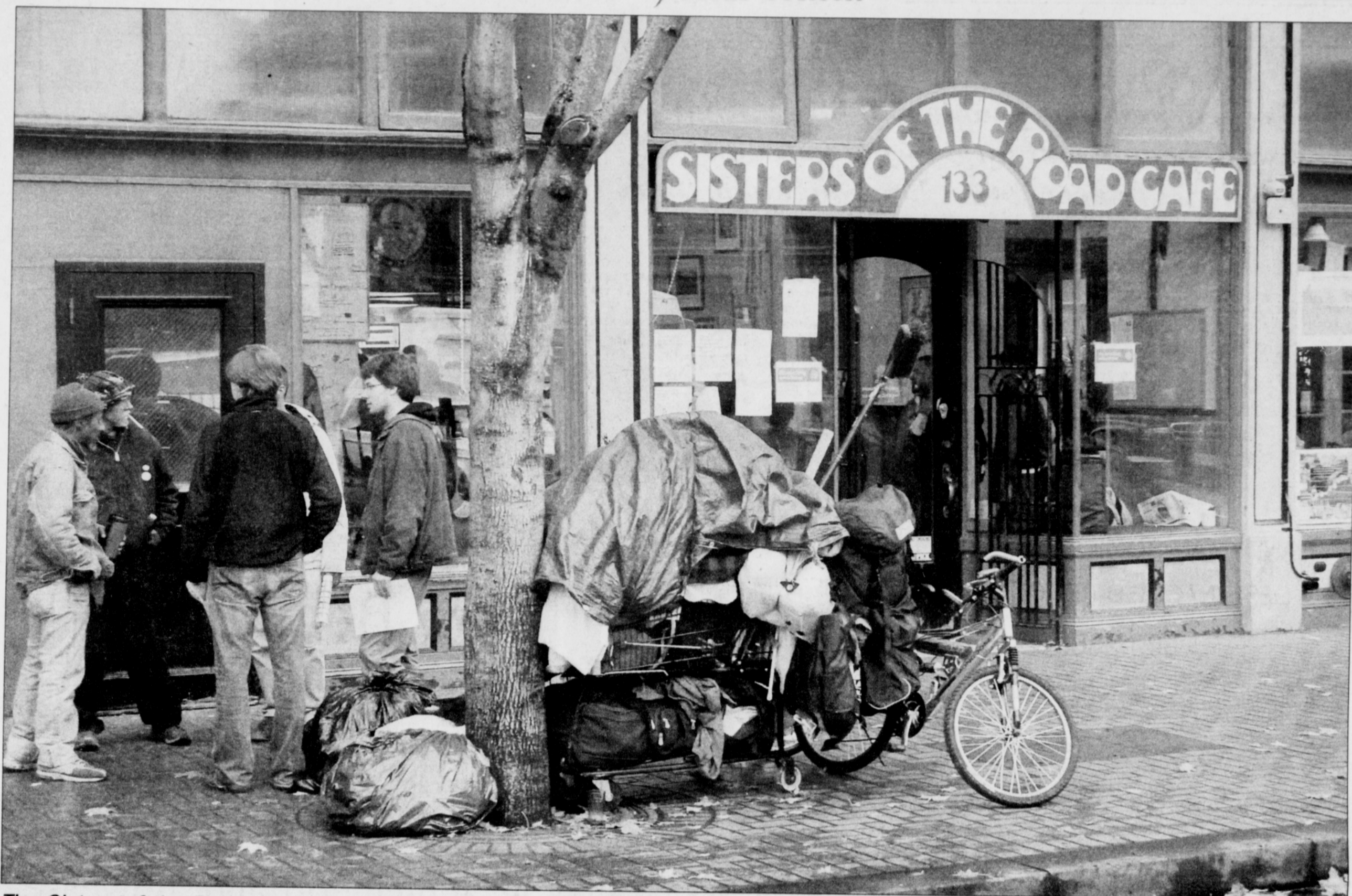
The Sisters of the Road uses nonviolence to support community-driven solutions to the calamities of homelessness and poverty. The Sisters' café is open to everyone, serving low cost, hot, nutritious meals.