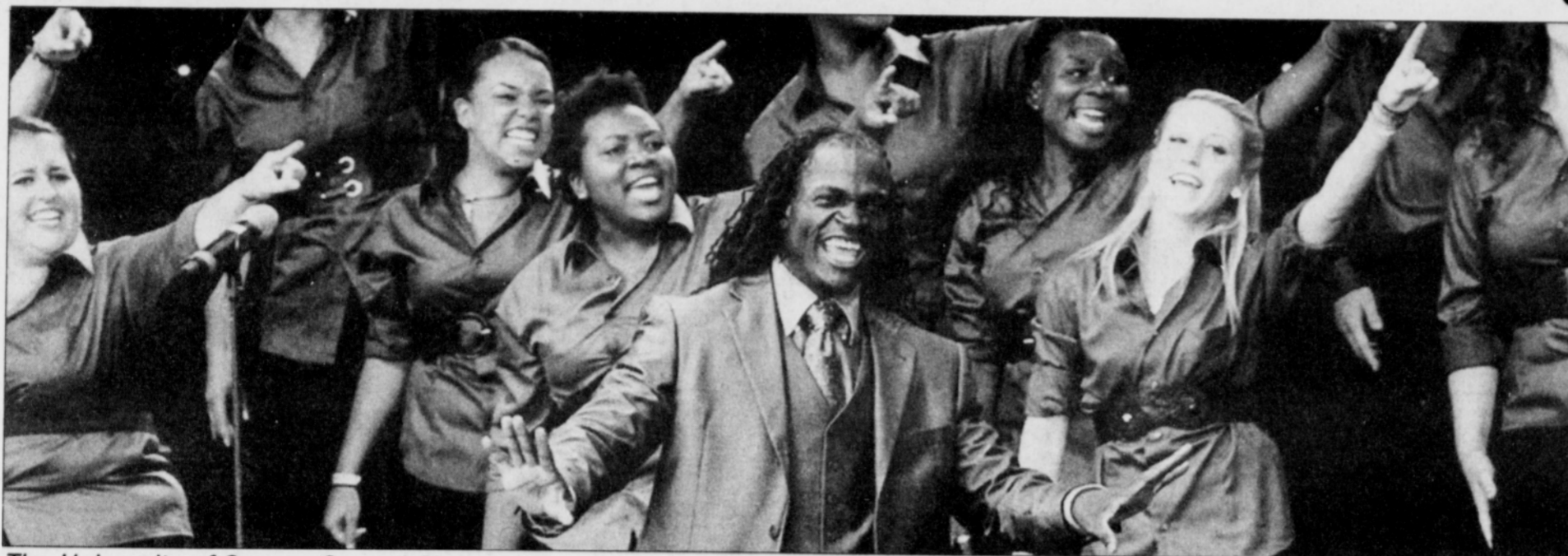
The University of Oregon Gospel Singers will perform several concerts during the week of the Martin Luther King Jr. holiday.