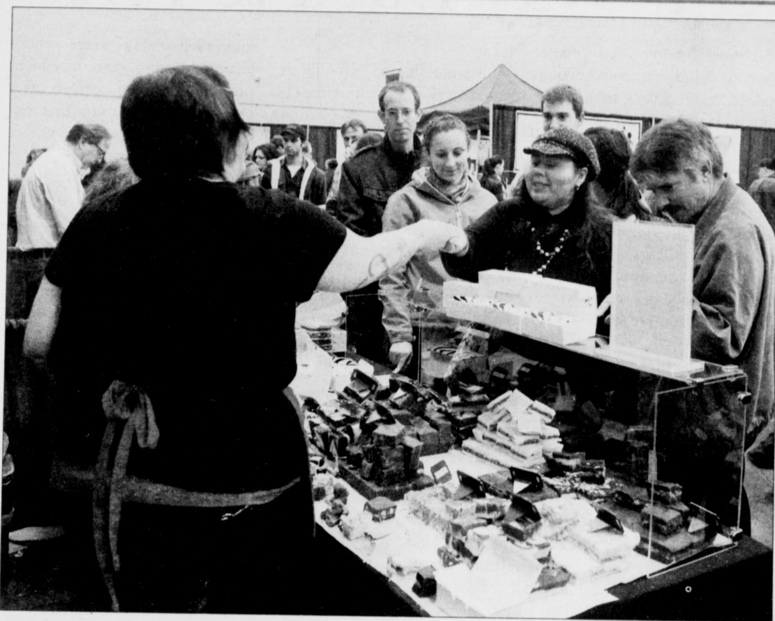
ChocolateFest at the Oregon Convention Center offers everything from European style drinking chocolate to artisan truffles