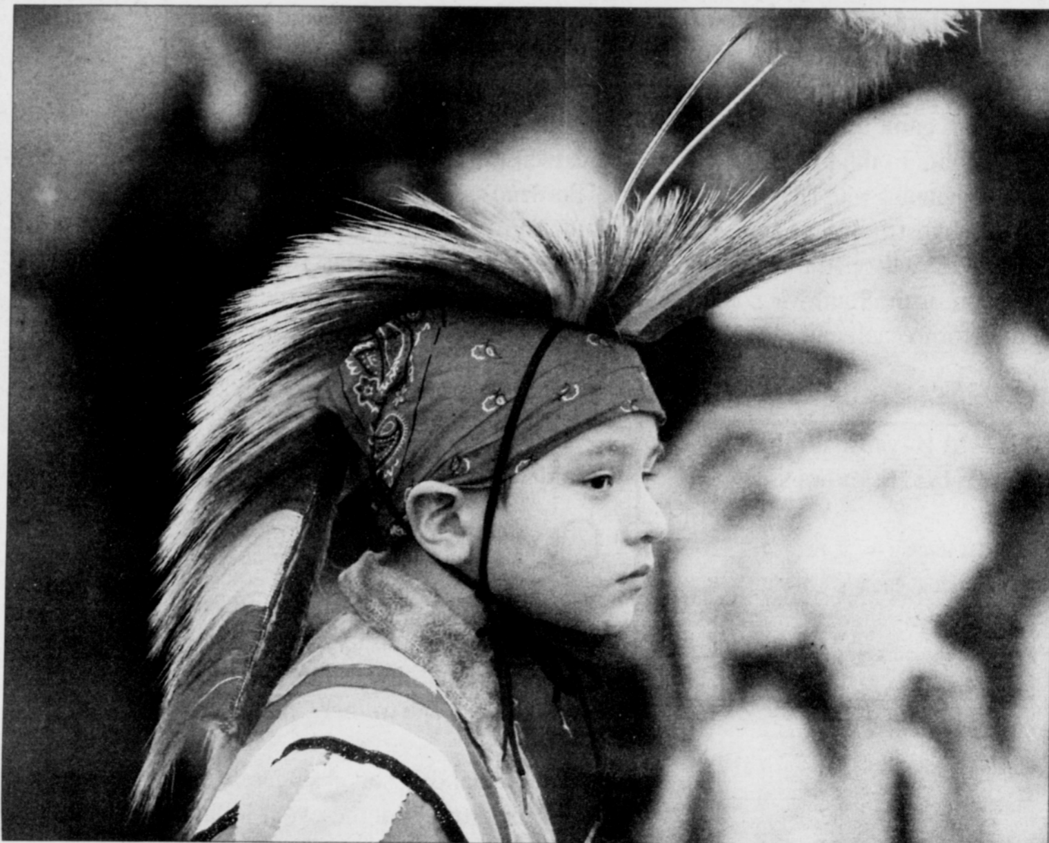
A young participant at Portland Community College's Winter Powwow. The annual event returns to the PCC Sylvania campus on Saturday, Jan. 19.