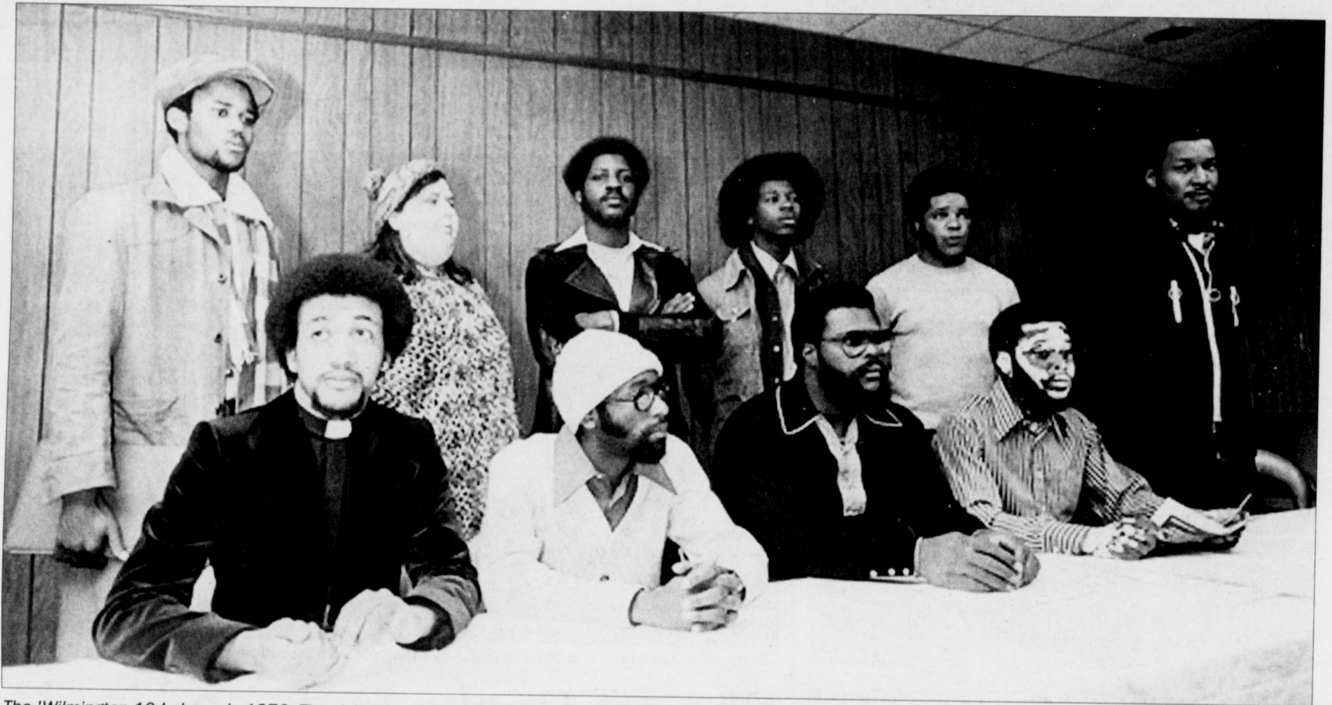
The 'Wilmington 10,' shown in 1976. The civil rights activists received a full pardon on Jan. 1 from North Carolina Gov. Beverly Perdue, 32 years after a federal court overturned their convictions.