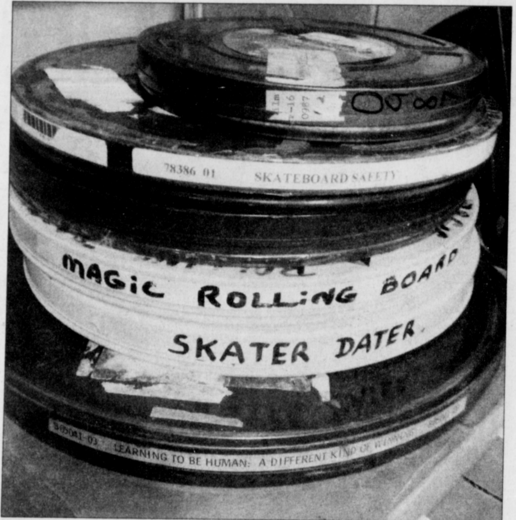
Rolling Deep: Skateboarding Films, 1965-1980 is presented at the Hollywood Theatre, on Thursday, Jan. 3 and Thursday, Jan. 10.